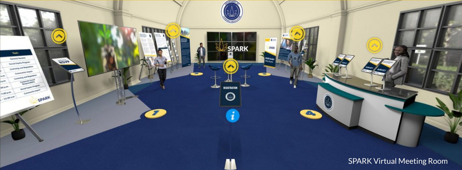
SPARK Virtual Meeting Room

CITY OF LOS ANGELES DEPARTMENT OF CANNABIS REGULATION