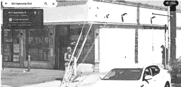
Goggle Maps Photo from January 2017 - Previous Dispensary - Note surrounded by Apartment Buildings /Homes